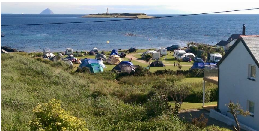
Seal Shore Campsite, Kildonan, Isle of Arran

For a more detailed write up of the IOTA expedition and more photos please read the excellent article written by Peter Day, G3PHO, the main event organiser. http://tinyurl.com/pjnptj5