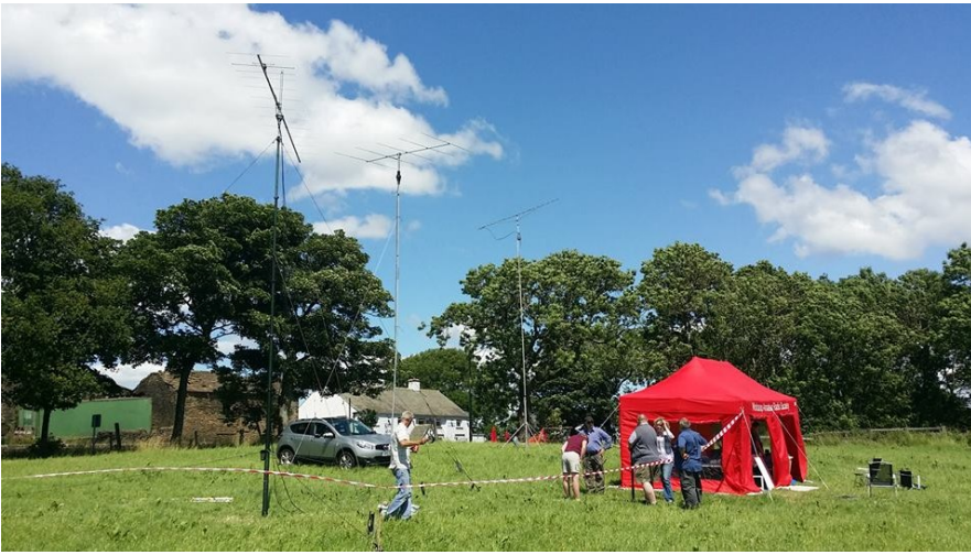
Masts up and ready to roll