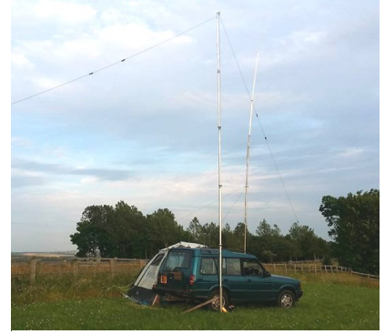
Have shack, will travel