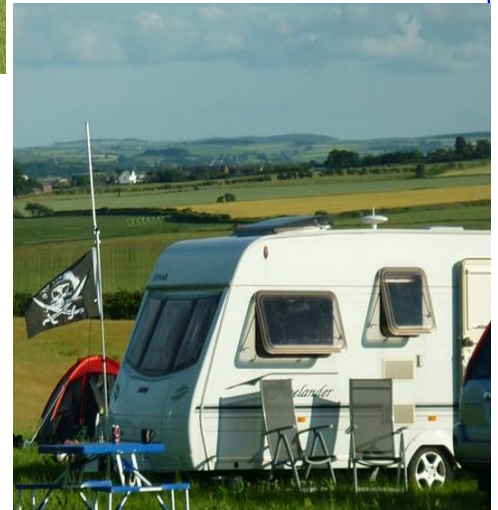
Our resident pirate